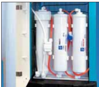
Front door accessible filter assembly. Separate water shutoff valve for easy filter service.